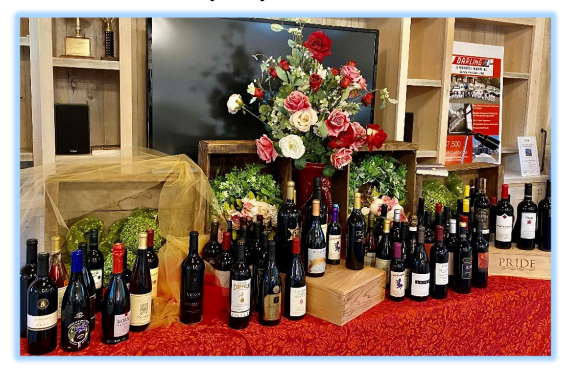
Derby Day Spirits Locker

One of these fabulous lockers could be yours! Raffle Tickets are $50 and $100 Derby Day Wine Locker