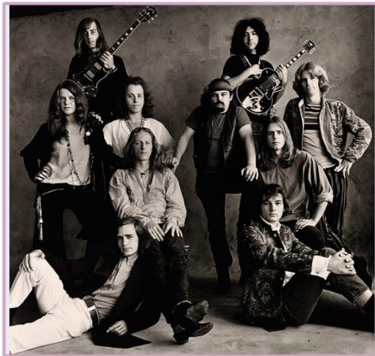
Irving Penn, Rock Groups

A regular contributor to Vogue magazine for more than six decades, he revolutionized fashion photography in the post-war period, positioning models against neutral backdrops. Best known for his psychologically penetrating portraits, Penn was a prolific artist whose career spanned 70 years and a wide array of interests. Organized by The Metropolitan Museum of Art and presented exclusively on the West Coast at the de Young Museum, the exhibition brings together approximately 175 works.